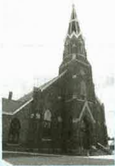
Our Lady of Lourdes Lourdes, IA