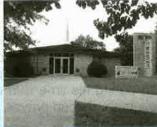
Immaculate Conception Elma, IA