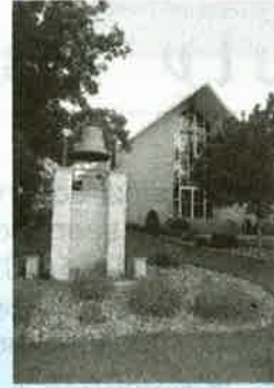
Immaculate Conception Riceville, IA