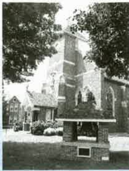
Saint Bernard Alta Vista, IA