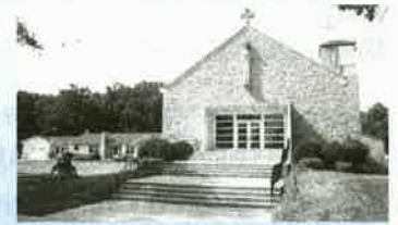
Saint Peter New Haven, IA