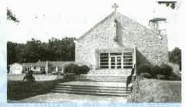
Saint Peter New Haven, IA