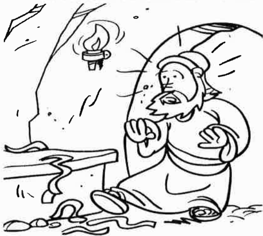
Easter Sunday - John 20:1-9

Read the Gospel of the week and color the image.