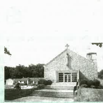
Saint Peter New Haven, IA