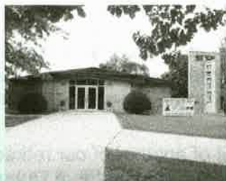
Immaculate Conception Elma, IA