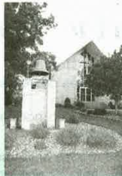
Immaculate Conception Riceville, IA