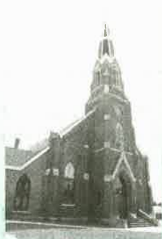
Our Lady of Lourdes Lourdes, IA