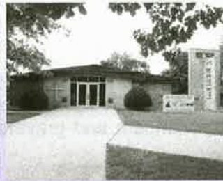
Immaculate Conception Elma, IA