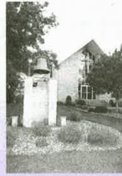
Immaculate Conception Riceville, IA