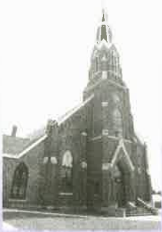
Our Lady of Lourdes Lourdes, IA