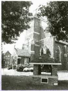
Saint Bernard Alta Vista, IA