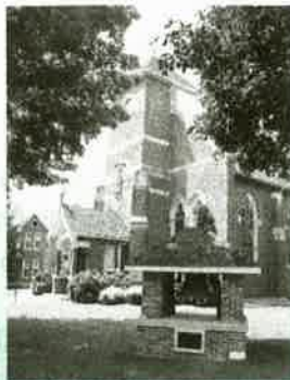
Saint Bernard Alta Vista, IA