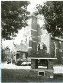
Saint Bernard Alta Vista, IA