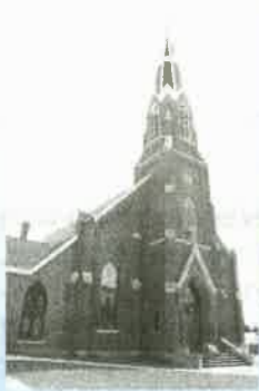
Our Lady of Lourdes Lourdes, IA