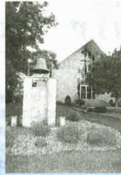
Immaculate Conception Riceville, IA