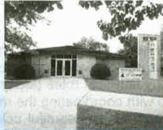
Immaculate Conception Elma, IA