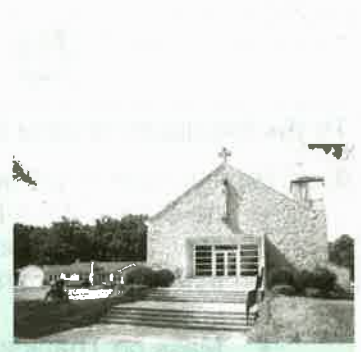
Saint Peter New Haven, IA