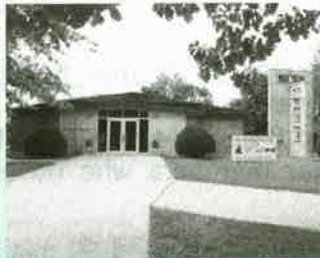
Immaculate Conception Elma, IA