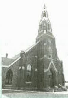
Our Lady of Lourdes Lourdes, IA