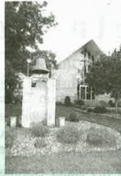
Immaculate Conception Riceville, IA