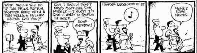
17th SUNDAY IN ORDINARY TIME