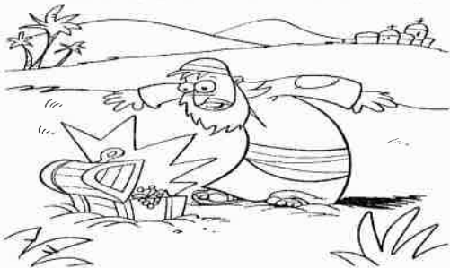
17th Sunday in Ordinary Time - Matthew 13:44-46