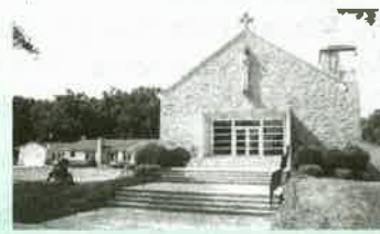
Saint Peter New Haven, IA