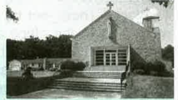
Saint Peter New Haven, IA