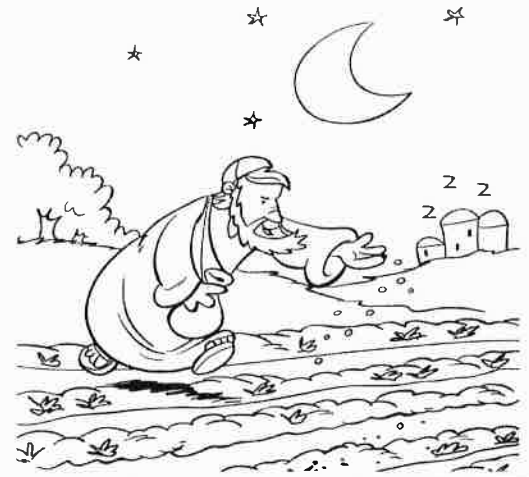
16 th Sunday in Ordinary Time • Matthew 13:24-43

COLOR Read the Gospel of the week and color the image.