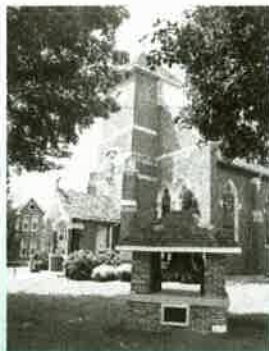
Saint Bernard Alta Vista, IA