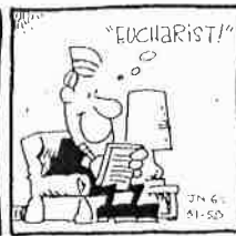
BODY AND BLOOD OF CHRIST