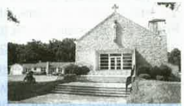
Saint Peter New Haven, IA