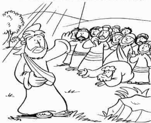
The Ascension of the Lord - Matthew 28:16-20