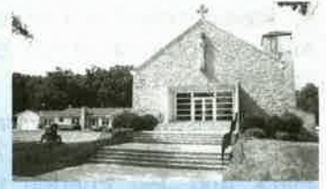
Saint Peter New Haven, IA