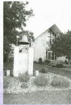
Immaculate Conception Riceville, IA