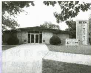
Immaculate Conception Elma, IA