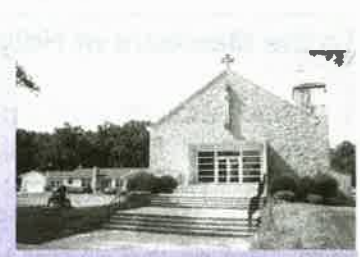
Saint Peter New Haven, IA