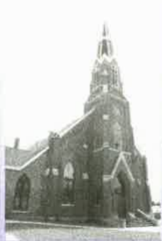
Our Lady of Lourdes Lourdes, IA