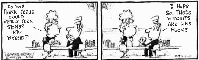
1st SUNDAY OF LENT