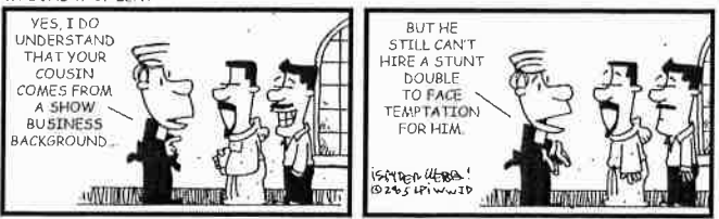
1st SUNDAY OF LENT