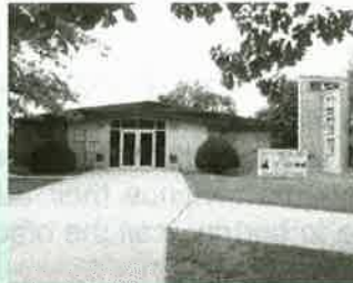
Immaculate Conception Elma, IA