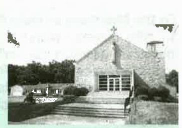
Saint Peter New Haven, IA