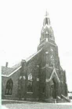
Our Lady of Lourdes Lourdes, IA