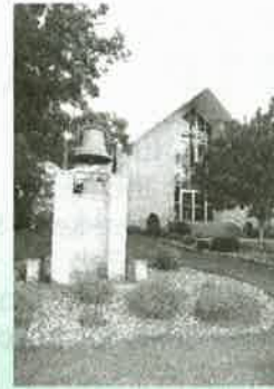
Immaculate Conception Riceville, IA