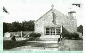
Saint Peter New Haven, IA