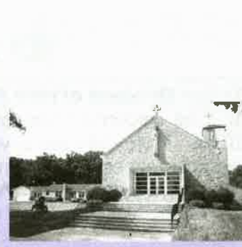
Saint Peter New Haven, IA