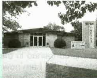
Immaculate Conception Elma, IA