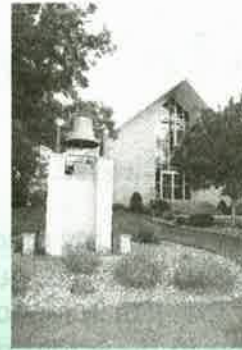
Immaculate Conception Riceville, IA