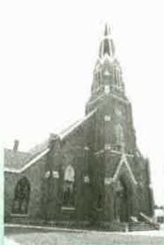
Our Lady of Lourdes Lourdes, IA