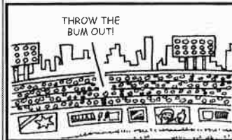
31ST SUNDAY IN ORDINARY TIME