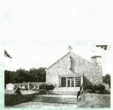
Saint Peter New Haven, IA