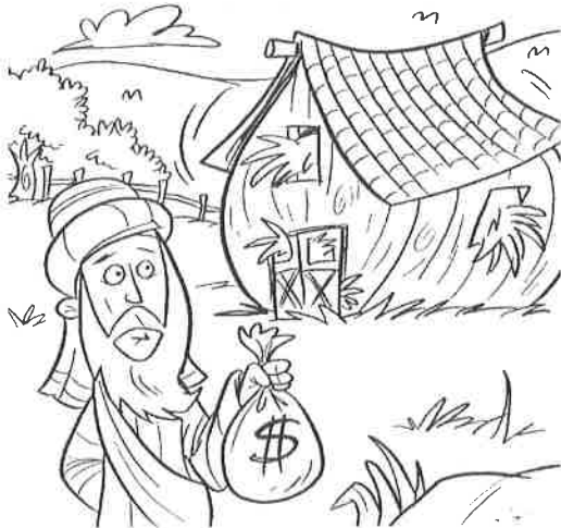
18 th Sunday in Ordinary Time • Luke 12:13-21

Read the Gospel of the week and color the image.