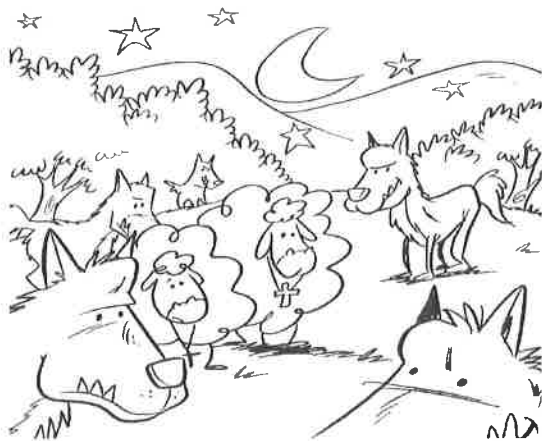
14 th Sunday in Ordinary Time • Luke 10:1-12, 17-20

Read the Gospel of the week and color the image.