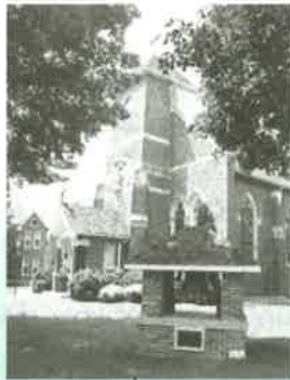
Saint Bernard Alta Vista, IA