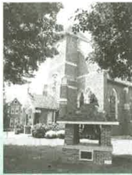
Saint Bernard Alta Vista, IA