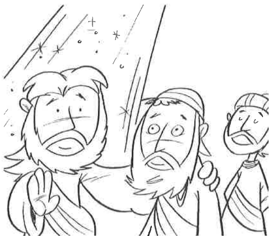
Pentecost Sunday - John 14:15-16, 23b-26

COLOR Read the Gospel of the week and color the image.