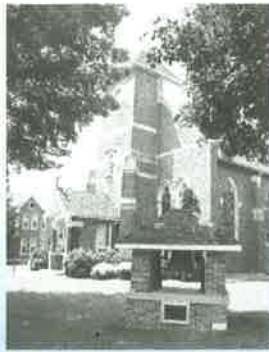
Saint Bernard Alta Vista, IA