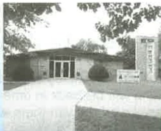
Immaculate Conception Elma, IA