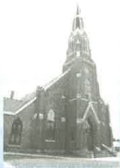
Our Lady of Lourdes Lourdes, IA