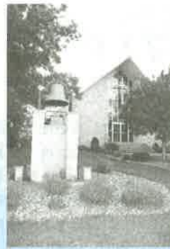
Immaculate Conception Riceville, IA