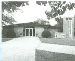
Immaculate Conception Elma, IA