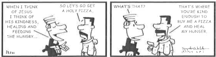
3RD SUNDAY OF EASTER