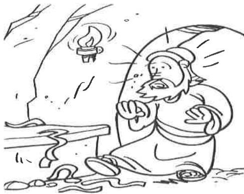
Easter Sunday • John 20:1-9

COLOR Read the Gospel of the week and color the image.