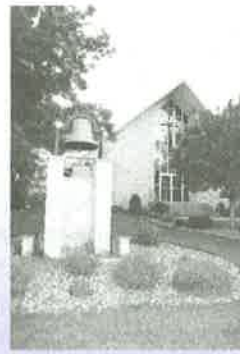
Immaculate Conception Riceville, IA