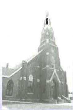
Our Lady of Lourdes Lourdes, IA