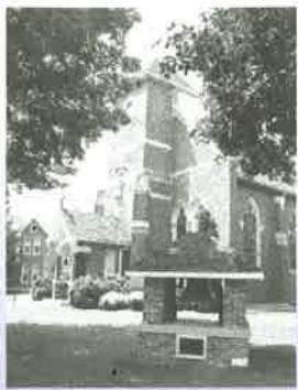
Saint Bernard Alta Vista, IA