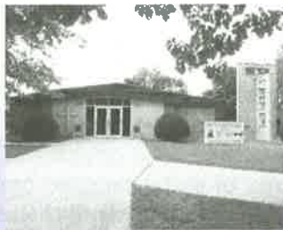
Immaculate Conception Elma, IA