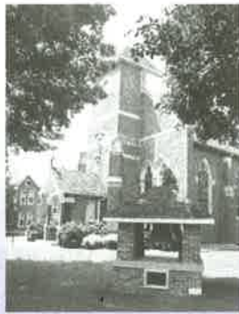
Saint Bernard Alta Vista, IA