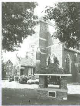
Saint Bernard Alta Vista, IA