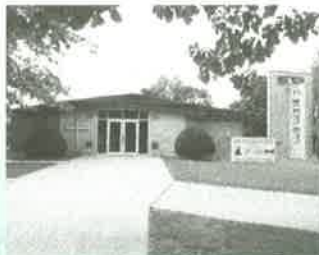
Immaculate Conception Elma, IA