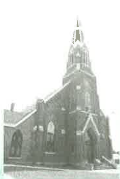
Our Lady of Lourdes Lourdes, IA