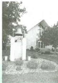
Immaculate Conception Riceville, IA