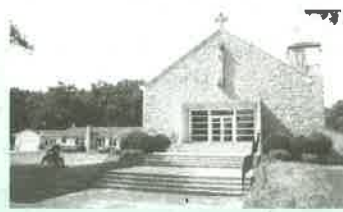
Saint Peter New Haven, IA