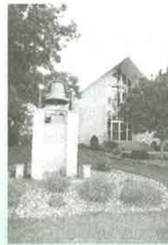
Immaculate Conception Riceville, IA