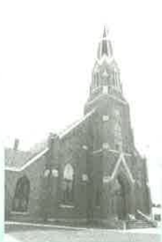
Our Lady of Lourdes Lourdes, IA