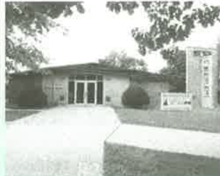
Immaculate Conception Elma, IA