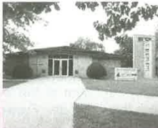
Immaculate Conception Elma, IA