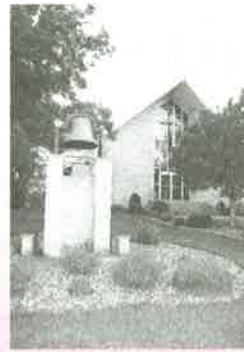
Immaculate Conception Riceville, IA