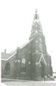
Our Lady of Lourdes Lourdes, IA