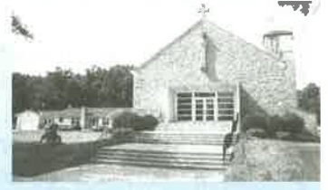
Saint Peter New Haven, IA