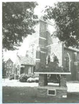
Saint Bernard Alta Vista, IA