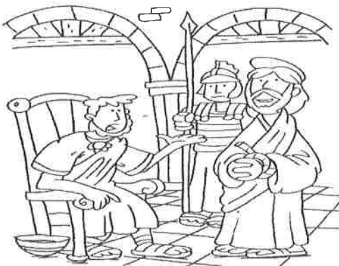
Christ the King • John 18:33b-37

Read the Gospel of the week and color the image.