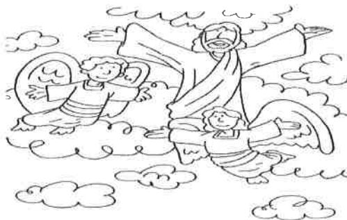
33rd Sunday in Ordinary Time - Mark 13:24-32

COLOR Read the Gospel of the week and color the image.