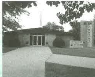
Immaculate Conception Elma, IA