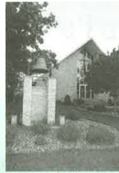
Immaculate Conception Riceville, IA