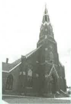
Our Lady of Lourdes Lourdes, IA