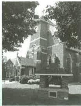
Saint Bernard Alta Vista, IA