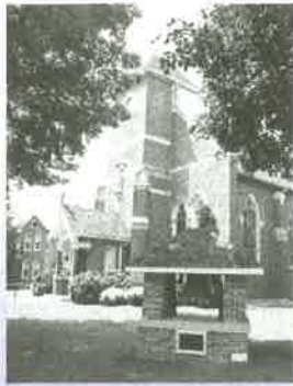
Saint Bernard Alta Vista, IA