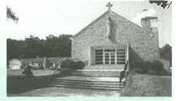
Saint Peter New Haven, IA