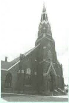
Our Lady of Lourdes Lourdes, IA