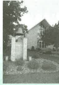
Immaculate Conception Riceville, IA