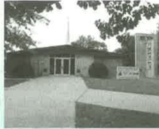
Immaculate Conception Elma, IA