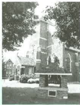
Saint Bernard Alta Vista, IA