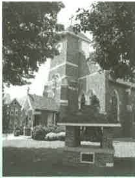
Saint Bernard Alta Vista, IA