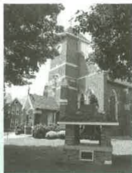
Saint Bernard Alta Vista, IA