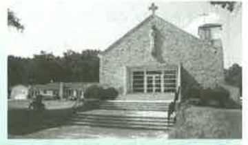
Saint Peter New Haven, IA