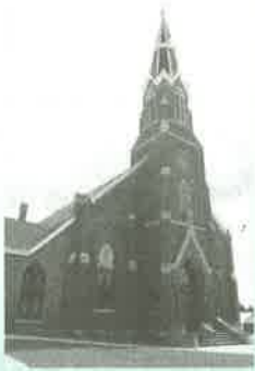
Our Lady of Lourdes Lourdes, IA