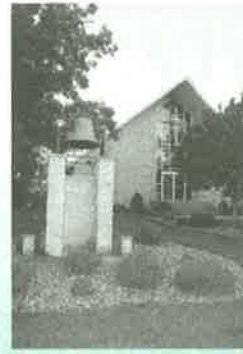
Immaculate Conception Riceville, IA