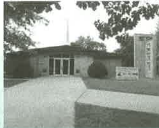
Immaculate Conception Elma, IA