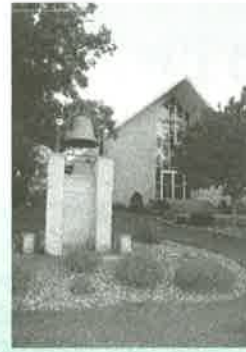
Immaculate Conception Riceville, IA