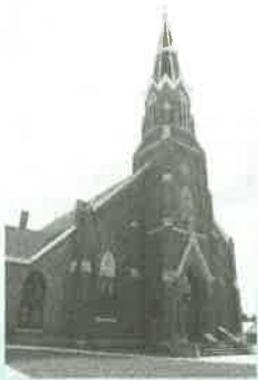
Our Lady of Lourdes Lourdes, IA